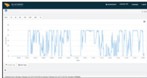
Number of units produced